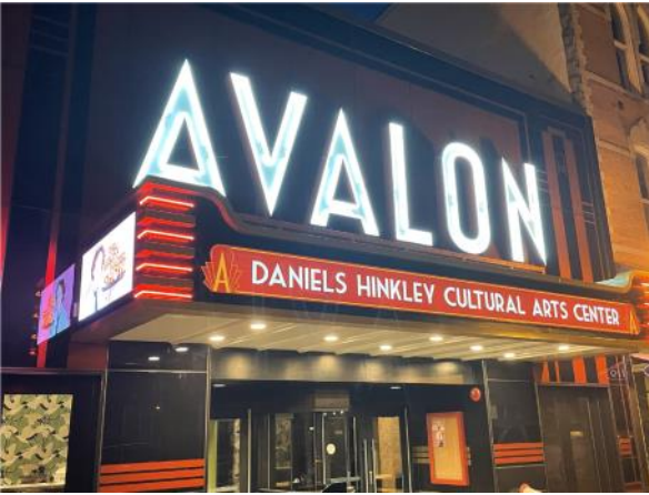
The Avalon Theatre is a beautifully renovated 1930's styled cultural and performing arts venue. Quarterly grants have been awarded to the theatre, supporting its annual summer youth camp.

The Quarterly Grant Program is overseen by the Program Distribution Committee, a group that has been integral to the Foundation since its inception in 1993 — with its inclusion in our bylaws underscoring grantmaking as a core principle of the Foundation. The Program Distribution Committee reviews grant applications and makes selections based on impact in the community. They ask questions like: "How many people in Union County will benefit from this initiative? What will be the overall impact of the project on the community?"