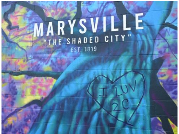
Public art mural painted on 2 nd Chances Thrift store in uptown Marysville. 100% of profits from the store go back to Union County. The mural was partially paid for through a quarterly grant from the Foundation.

So where does this “unrestricted” money come from? A large portion comes from investment earnings as well as board-authorized funds from our operations endowment. Instead of buying a corporate jet, we choose to actively invest our money in the community that we are a part of: Union County.